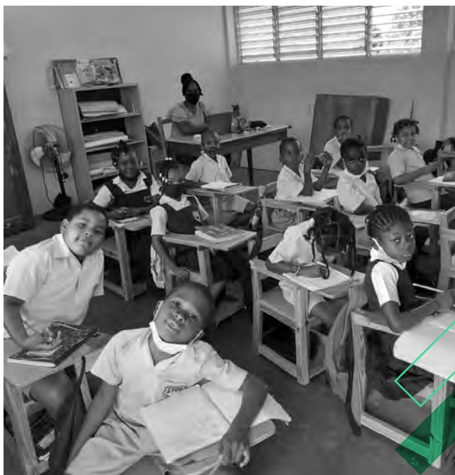
Students in St. Vincent and the Grenadines using furniture manufactured by local joiners.

Additionally, for the safe return to schools and to maintain the required social distance, it was important to make sure students had single desks and chairs. This offered another opportunity to provide income-generating activities at the community level. Through the GPE program, the Ministry of Education in St. Vincent and the Grenadines, for example, engaged local joiners to manufacture the required furniture. Through interventions like this, over 2,500 pieces of furniture were distributed to St. Lucia, Grenada and St. Vincent and the Grenadines.