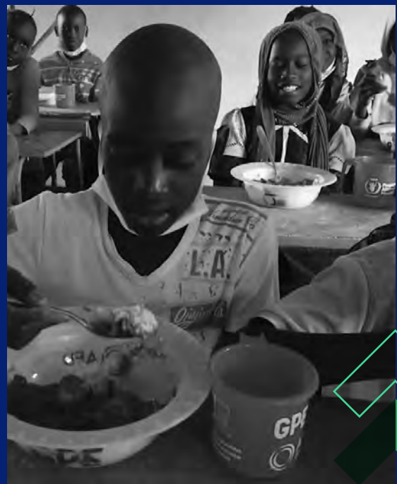
Students eating at Nguekhokh school canteen in Senegal.

Thanks to this partnership, more students in Senegal received nutritious meals during the COVID-19 crisis and were able to continue learning in school.