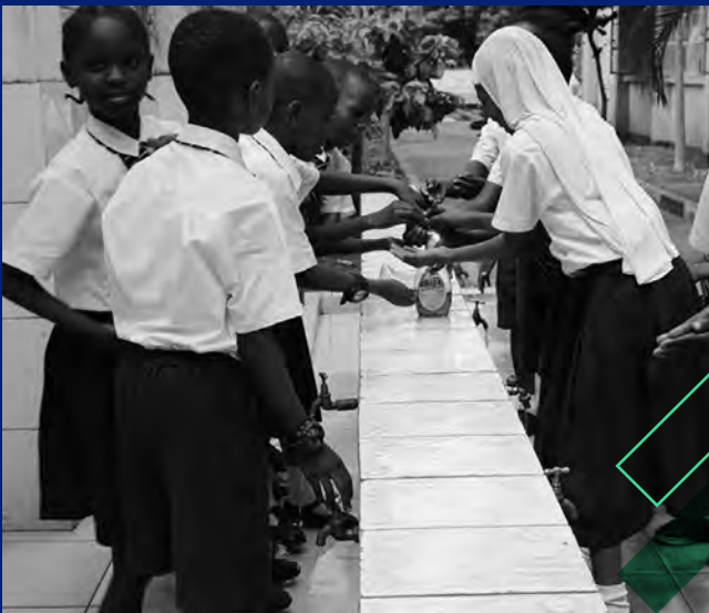
Students wash their hands at Diamond Primary School.

During the COVID-19 pandemic, health and hygiene practices have taken on new importance throughout schools in Tanzania. Historically, hygiene-related diseases have been linked to student absenteeism. The increased focus on hygiene practices is helping keep students in school.