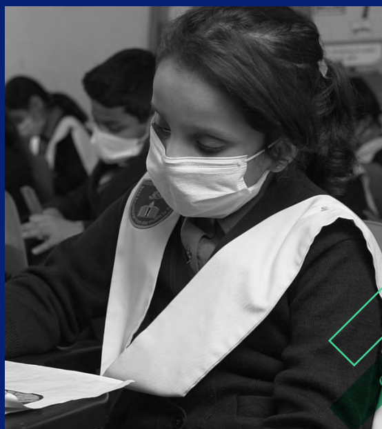
Health and hygiene protocols being followed in the classroom of a girls' school.

But campaign messages now go beyond health and safety measures: they include promoting distance learning content, the importance of learning continuity and reenrollment, and the value of girls' education. Mental health is also addressed by sharing information about how to cope with stress related to the pandemic.