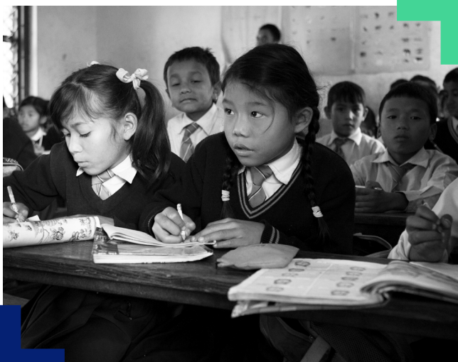
Primary wing of Adarsha Saula Yubak Higher Secondary School, Bhainsipati, Lalitpur, Nepal.

Partners can support the Multiplier by funding GPE directly and by mobilizing cofinancing that enables countries to access the Multiplier.